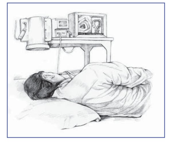
During colonoscopy, patients lie on their left side on an examination table.

During colonoscopy, patients lie on their left side on an examination table. In most cases, a light sedative, and possibly pain medication, helps keep patients relaxed. Deeper sedation may be required in some cases. The doctor and medical staff monitor vital signs and attempt to make patients as comfortable as possible.